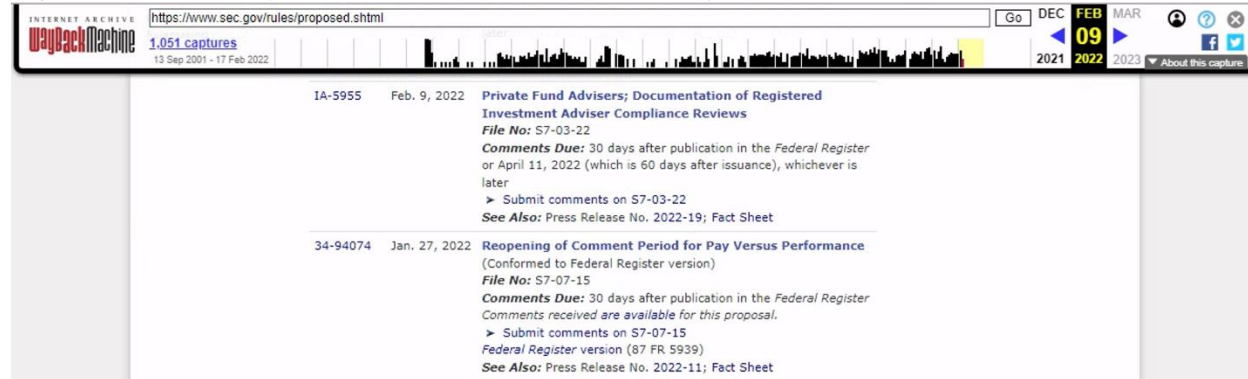
Figure 3: Screenshot of the SEC’s proposed rules on February 9, 2022.

17