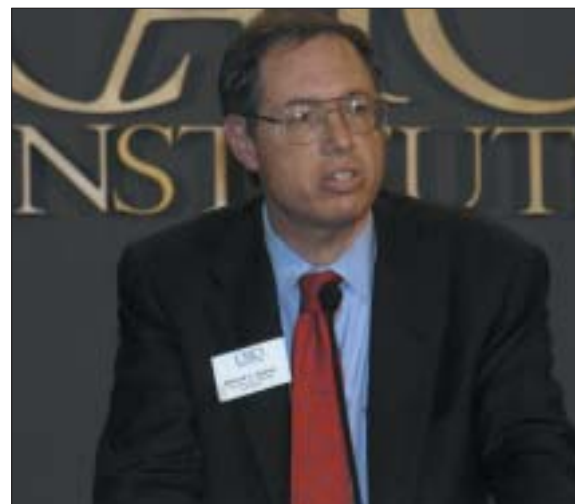
Richard Epstein of the University of Chicago Law School delivers the annual B. Kenneth Simon Lecture.

For the third year in a row, the Review was published on Constitution Day, September 17. Its publication was kicked off by a daylong conference, at which leading constitutional scholars examined the just-completed term and previewed the most important cases in the upcoming term. Probably the most anticipated decision last term was McConnell v. FEC , in which the Court upheld the controversial McCain-Feingold campaign finance reform law. FEC chairman Bradley Smith blasted the decision, which he said gives Congress wide latitude to restrict political speech, traditionally a core First Amendment value. He predicted that the current legal confusion