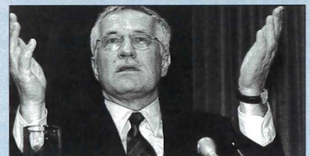
Cato publishes Vaclav Klaus, p. 5